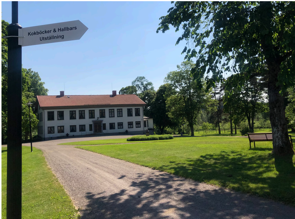
Photo Cookbooks and Sustainability road sign in Swedish, in front of Alfred Nobel House