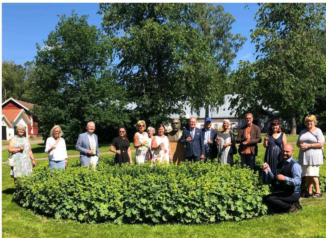
VIP Inauguration with Champagne Gosset